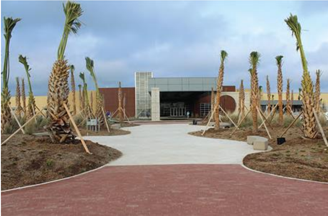
The community of McAllen, Texas reclaimed this abandoned big box store as a new home for its main public library.